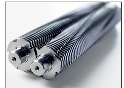
The cutting cylinders are milled from a solid bar of German Solingen steel for strength.