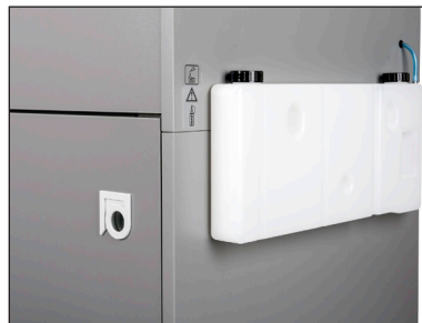
The 1 gallon EvenFlow Lubricator provides continuous lubrication for peak performance.